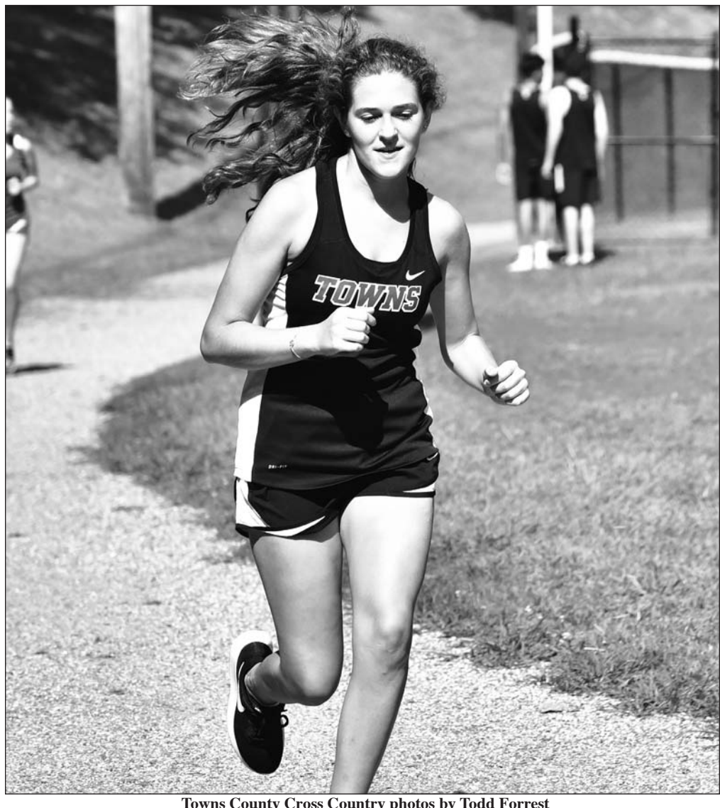
Towns County Cross Country